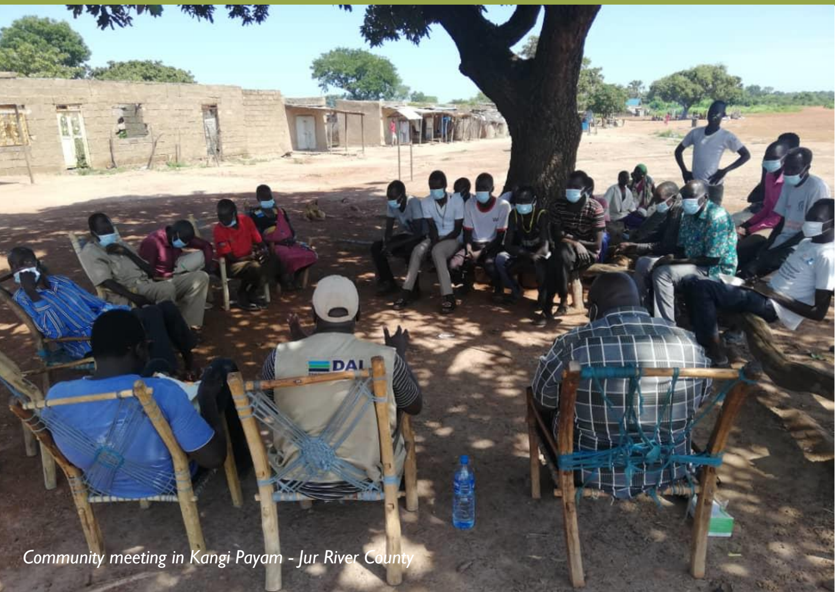
Community meeting in Kangi Payam - Jur River County